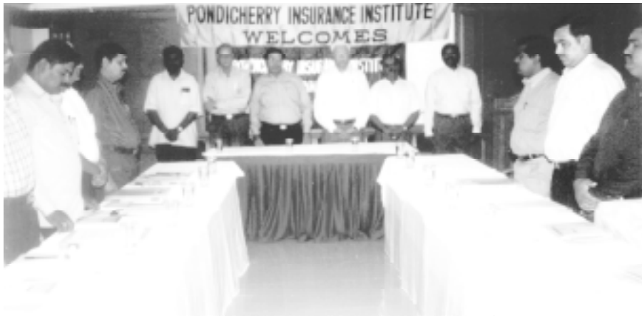
Prayer in progress