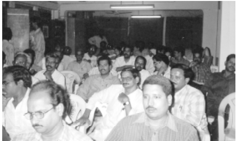
A section of audience.

In the General Body Meeting prizes were distributed to the members who secured highest marks (not less than 60) in various subjects of May 2003 and Nov 2003 examinations among Institute members. Diplomas were presented to the members who completed Associateship and Fellowship in Nov 2002 and May 2003 examinations.