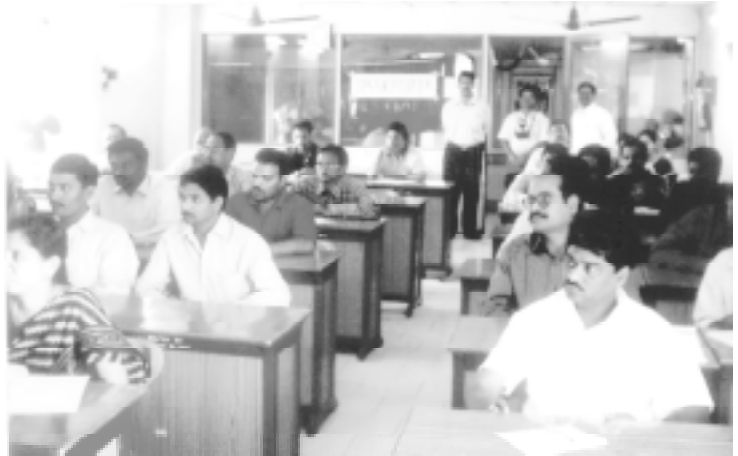
The participants at the "Tips for Interview" programme.

The participants really felt happy over the interest taken by the Institute in conducting the coaching classes for H.G.A. interview and expressed that the classes really helped them in boosting their confidence in facing the interviews. Out of the 15 selected for promotion, 13 were from this session.