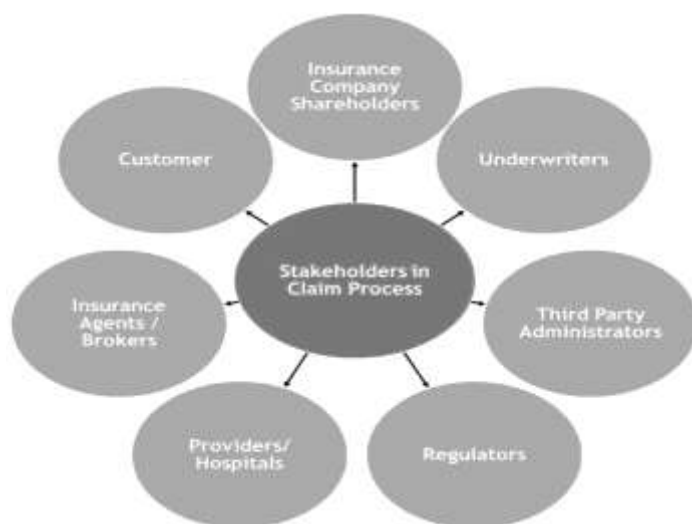
Diagram 1: Stakeholders in claim process

One needs to understand the parties interested in the claims process before looking at how claims are managed.