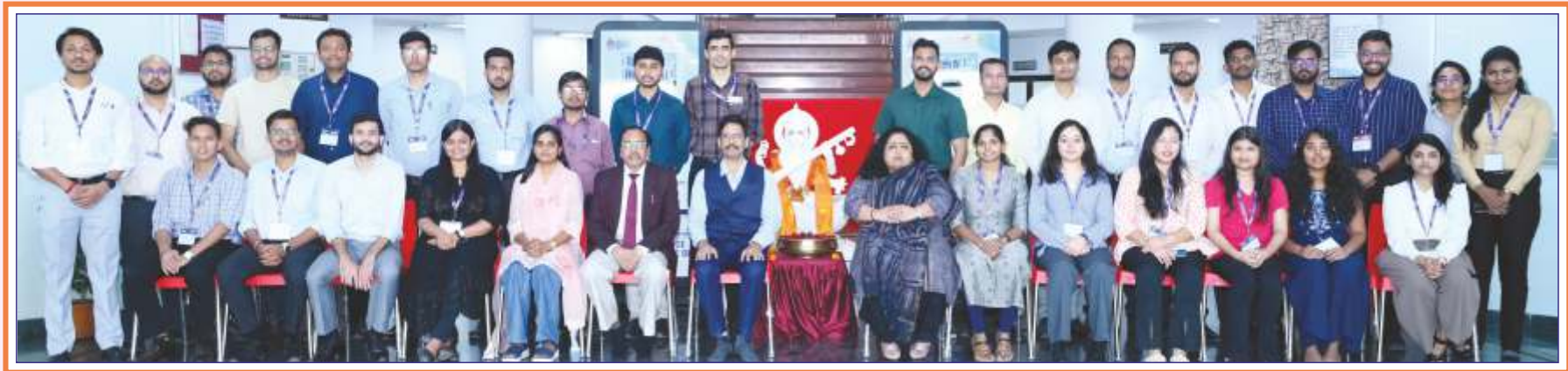
Induction Training Program for GIC Re - 19.01.2026 to 30.01.2026