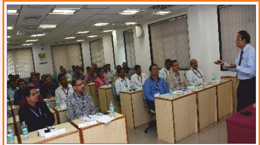
Classroom - 2