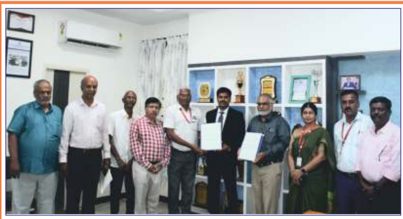
MOU Signed with Dr. N.G.P. Arts and Science College, Coimbatore on 13th October, 2025.