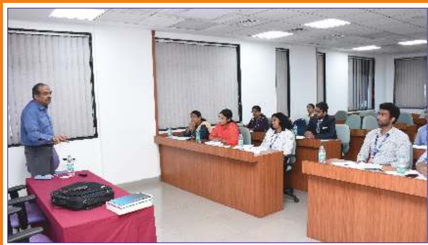
Classroom - 1