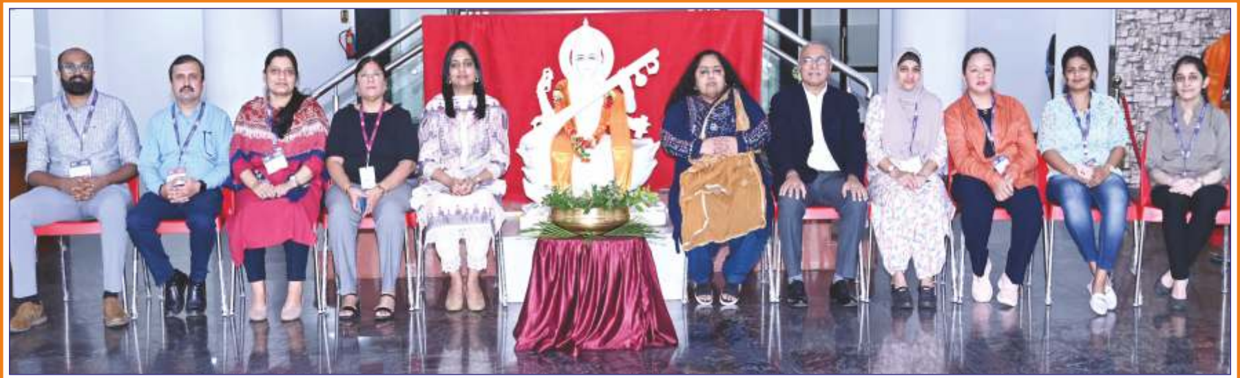
Liability Insurance Focus Financial Lines (17.09.2025 to 18.09.2025)