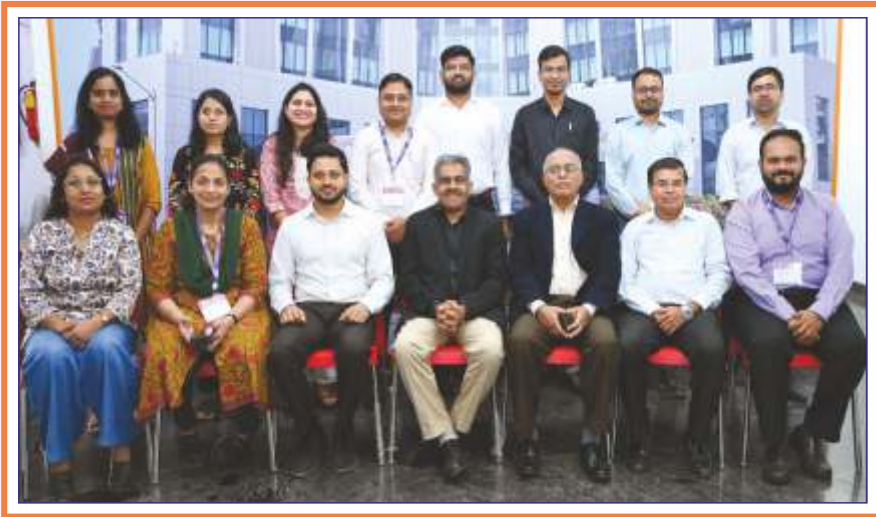
Training Program on Marine Cargo Insurance- Underwriting and Claims - 12.02.2026 to 13.02.2026