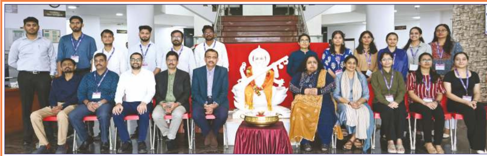
Workshop on Soft Skills (Basic level) for Scale-1 & 2 officers of GIC-Re (24.09.2025 to 26.09.2025)