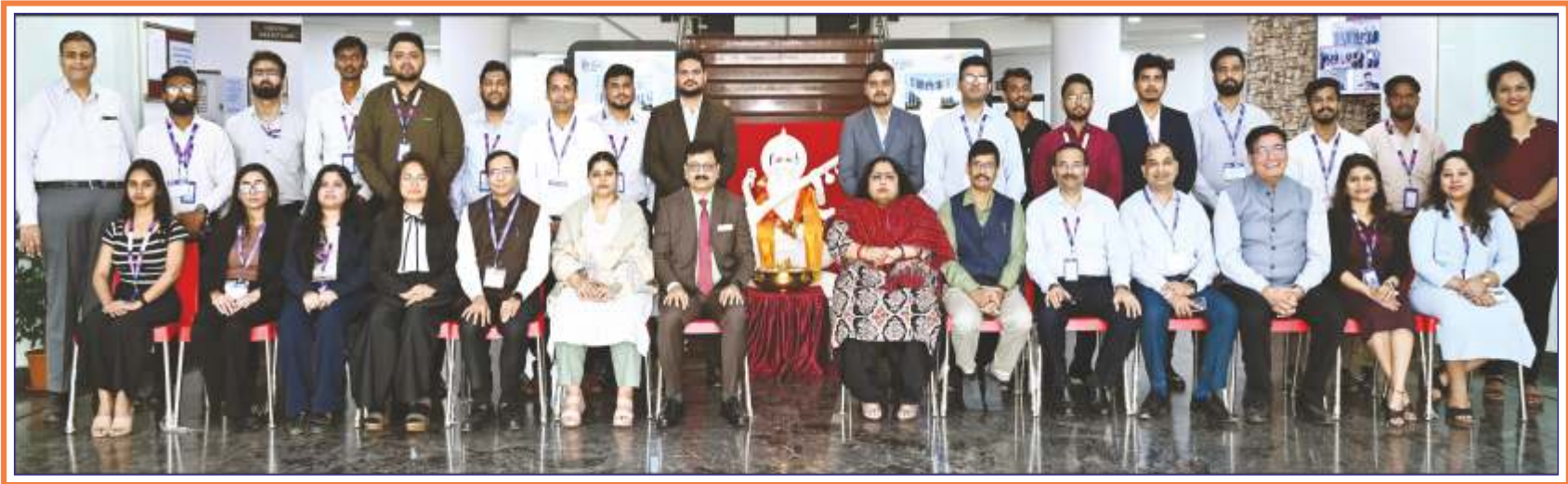
SBI Pension Fund : 3 Day Employee Induction Program (26.11.2025 to 28.11.2025)