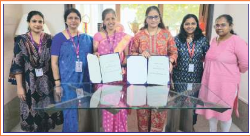
MOU Signed with Sasmira's Institute of Management Studies & Research on 10th July, 2025.