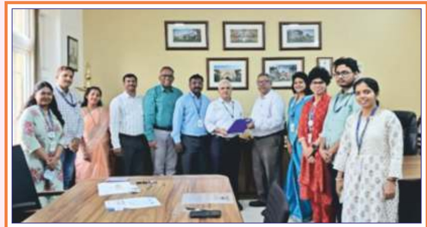
MOU Signed with Modern Education Society's D.G. Ruparel College of Arts, Science and Commerce on 16th February, 2026.