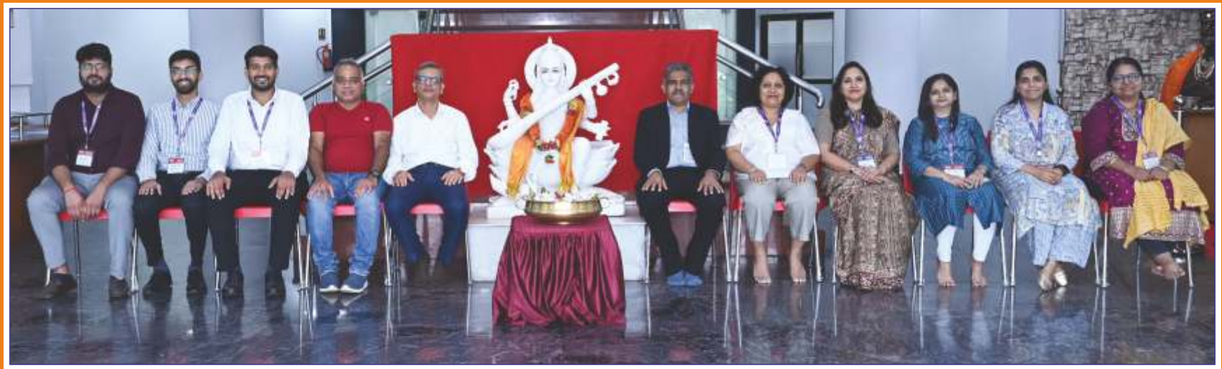
Marine Cargo Claims & Fraud Management (10.07.2025 11.07.2025)