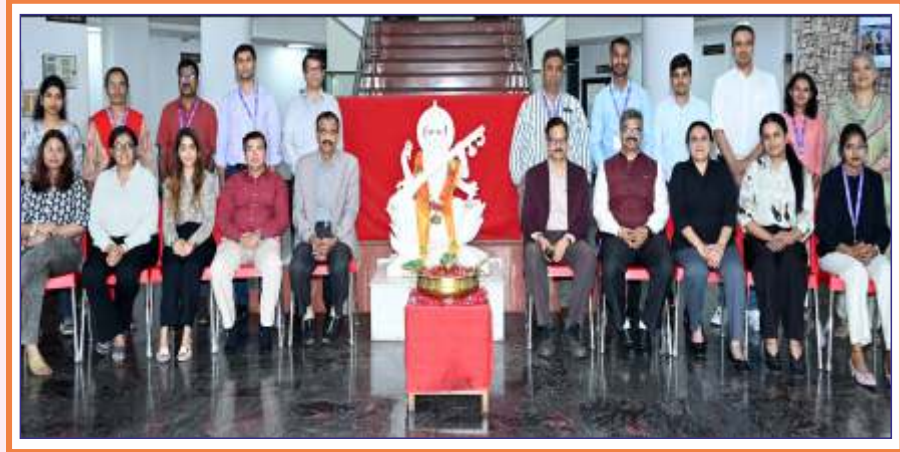
Legal & Regulatory Compliance in Insurance (13.05.2025 to 14.05.2025)