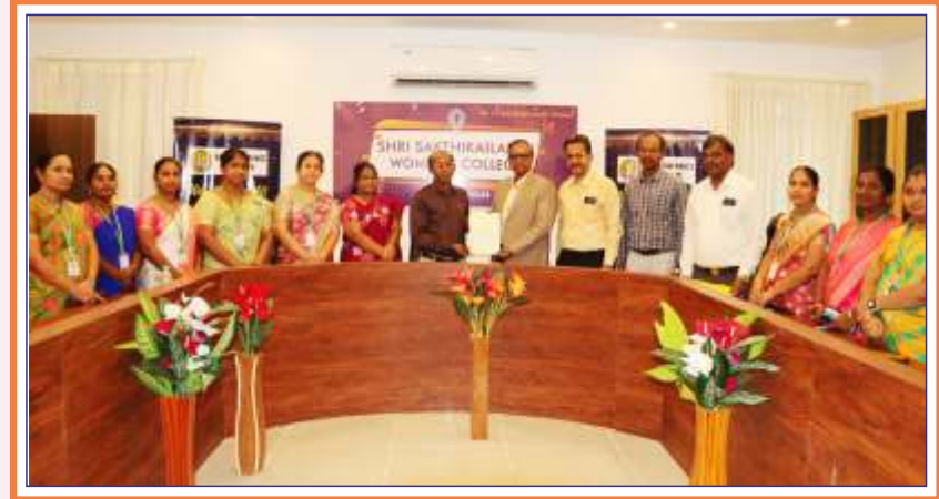
MOU Signed with Sri Kailassh Women's College (Autonomous), Salem on 8th January, 2026.