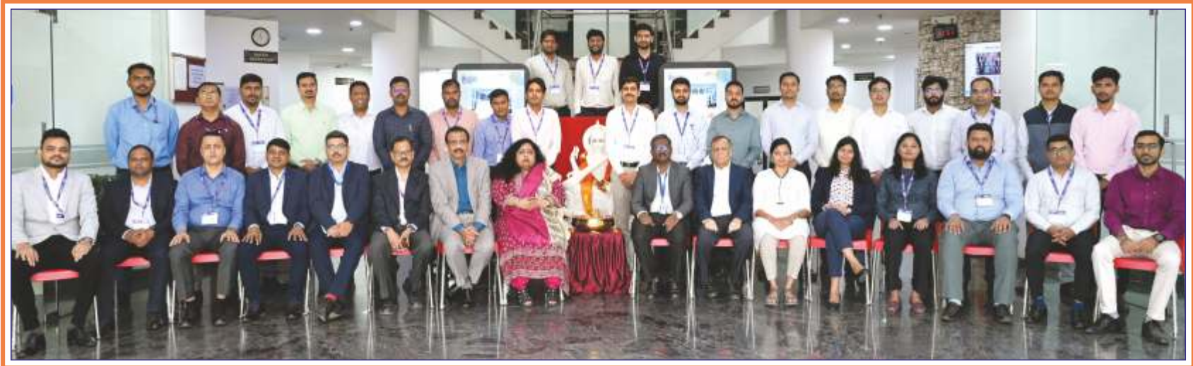
Soft Skill Training Program - Customized for ECGC Ltd (24.11.2025 to 26.11.2025)