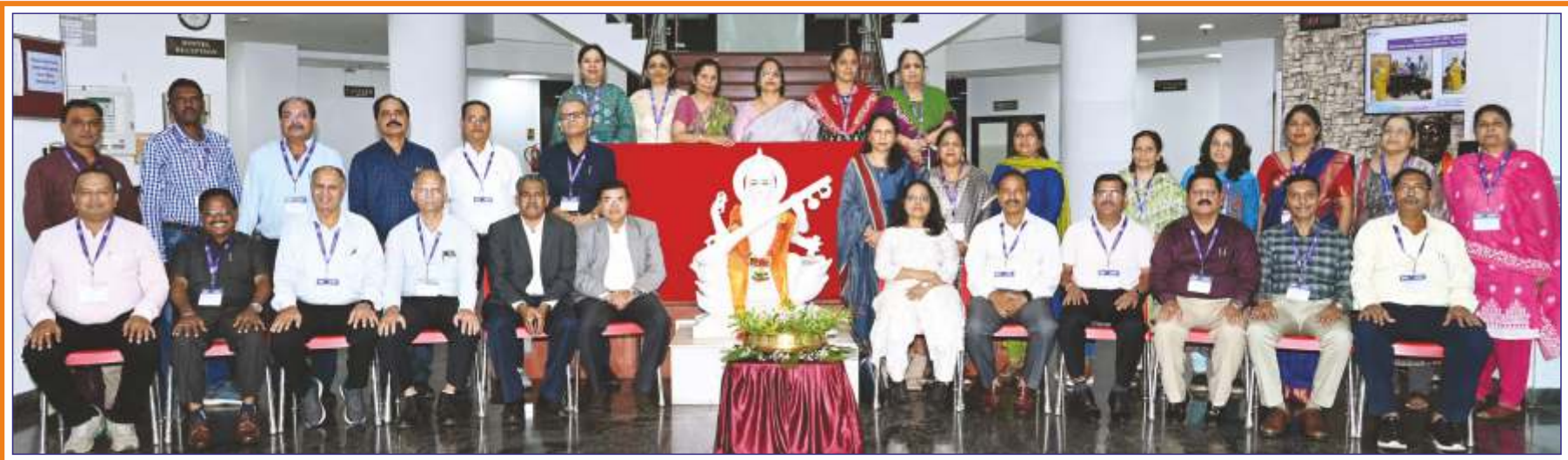
Training Programme for Retiring Executives ( Scale I,II and Class II ) The New India Assurance Co Ltd (18.06.2025 to 20.06.2025)